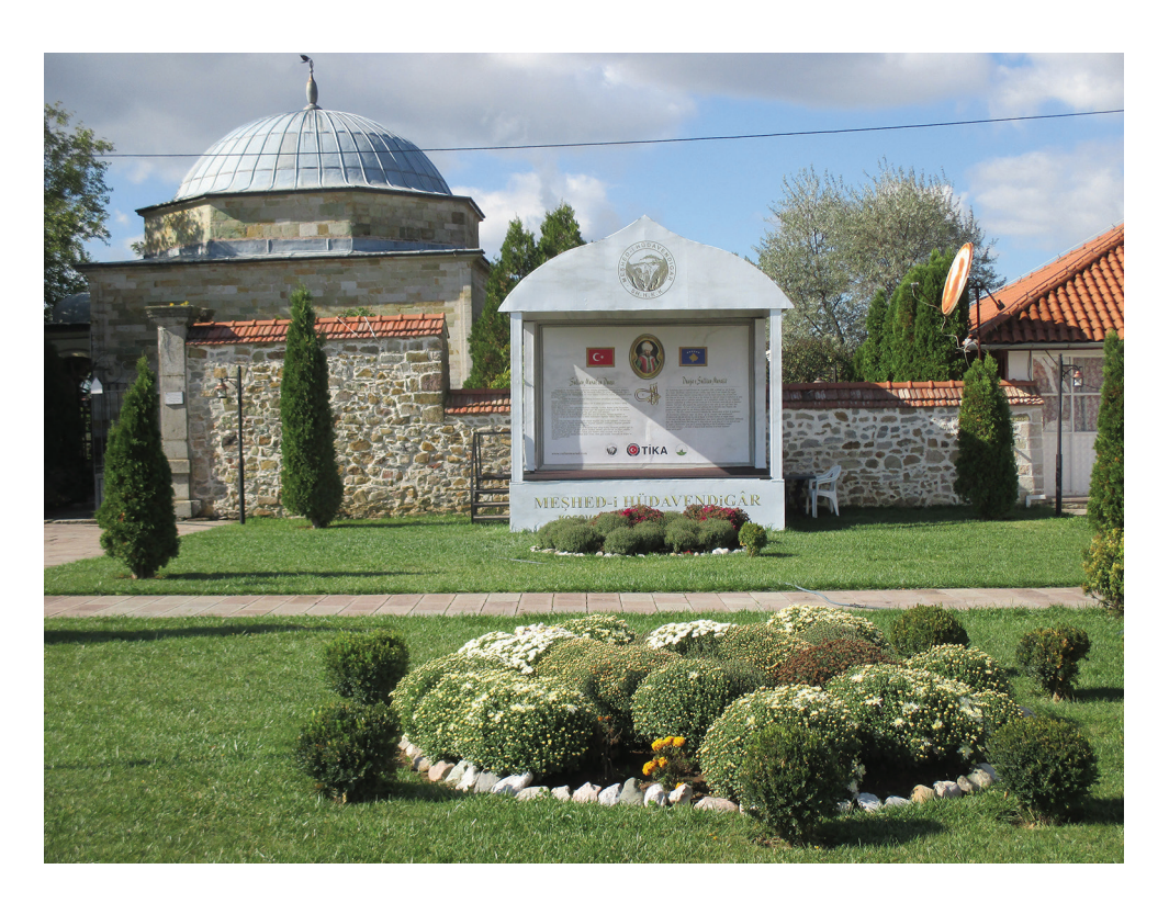
Photo 1. Sultan Murad's mausoleum with the memorial tablet of the Turkish Cooperation and Coordination Agency (TIKA)