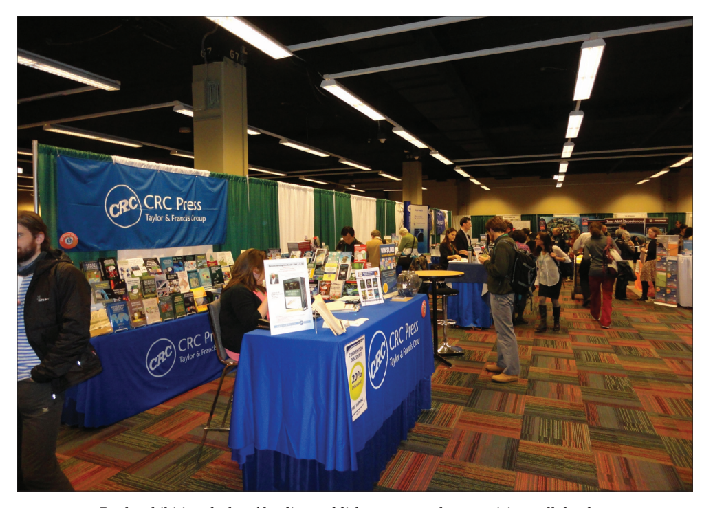
Book exhibition desks of leading publishers attracted many visitors all the day

2. Symposium on Physical Geography: Environmental Reconstruction – A Nexus of Biogeography, Climatology and Geomorphology. The goal of the all-day symposium was to facilitate and enhance the dialog among physical geographers on the challenges, new trends and approaches related to physical geography. The symposium started with two morning sessions of invited presenters around the theme involving - in a broader sense – "the study of past climates, landscapes, and biological systems along with the reclamation of altered environments". In the afternoon there was a poster session (as part of the symposium) with about 100 posters on all aspects of physical geography. "The Conversation on the Future of Physical Geography" was the second main goal of the symposium and it was held on 24th April. This was the continuation of the dialog from the earlier session on how to enhance physical geography within the AAG, because the majority of sessions focused on human geography.