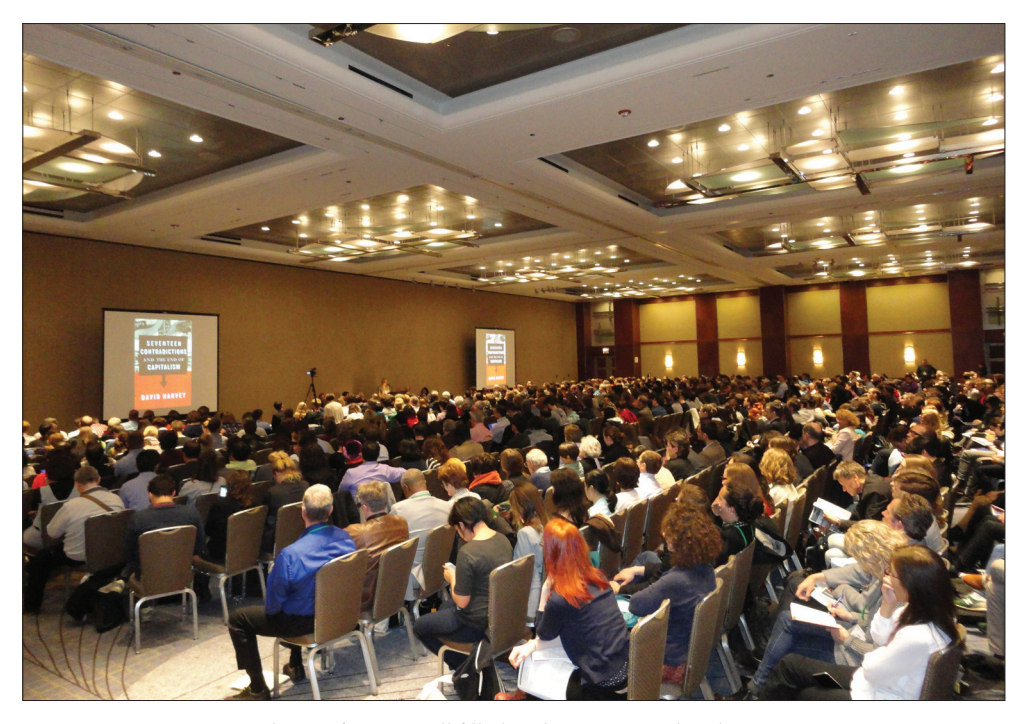
The Conference Hall filled with international audience

In this short report the emphasis will be put on the introduction of the main themes of the conference since each year the AAG defines a few themes for its annual meeting in order to provide a fresh and engag-