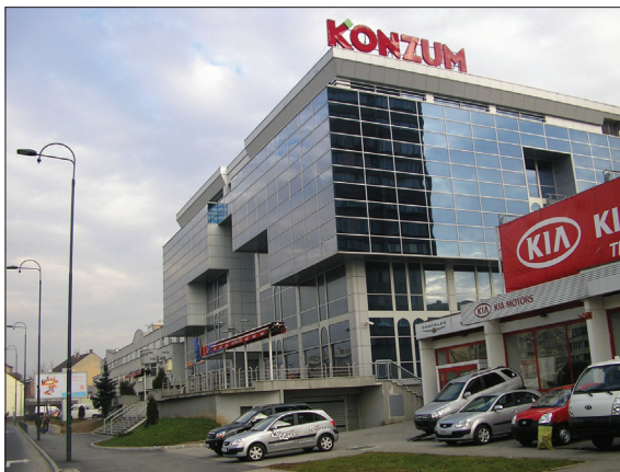
Photo 2. New supermarkets in central Sarajevo