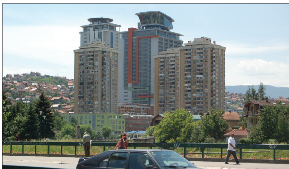
Photo 3. Bosmal City Center in Sarajevo