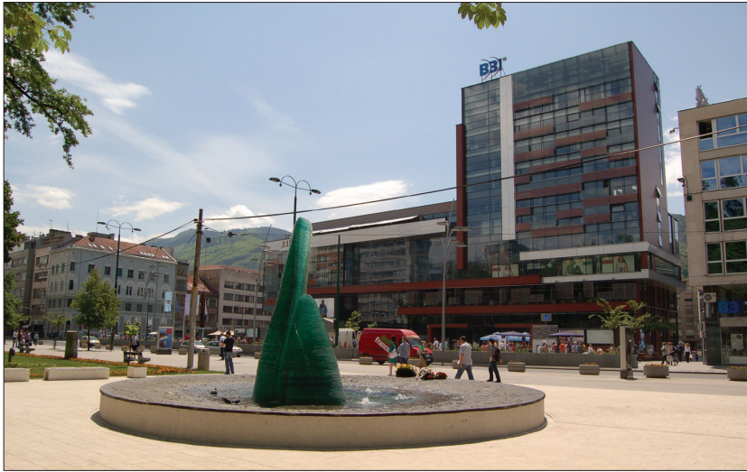
Photo 1. The new BBI Center in Sarajevo