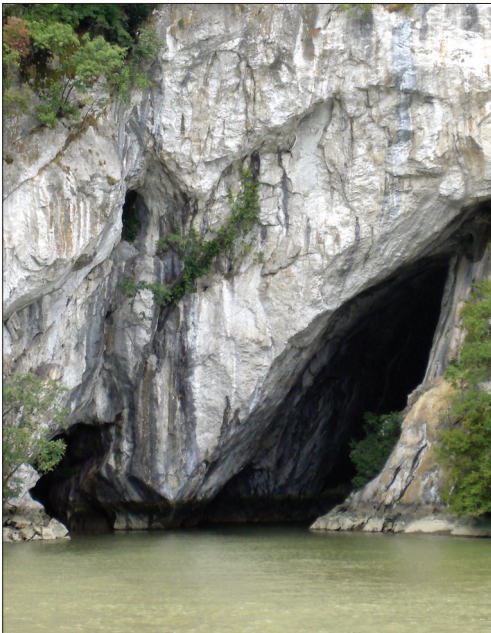
Cazanele Mare Cave

papers, one from each country. The conference continued in sections. The physical geographical section included particularly interesting presentations by researchers of the Geographical Institute of the Romanian Academy of Sciences on the application of GIS techniques to the solution of various geomorphological problems. Thanks to the publication opportunity offered by the hosting institution, the papers of the conference will appear in the forthcoming issues of Forum Geografic , a journal edited at the University of Craiova, in English, in 2011.