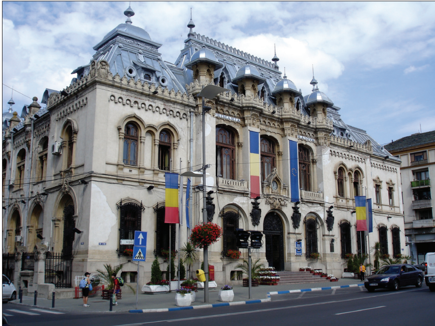
Craiova Town Hall

The papers presented covered various fields of physical and human geography and also important topics from the related disciplines (including political sciences and demography). The first plenary lecture was held by Dénes Lóczy entitled "Floodplains – links between countries and landscapes", followed by Serbian, Bulgarian and Romanian