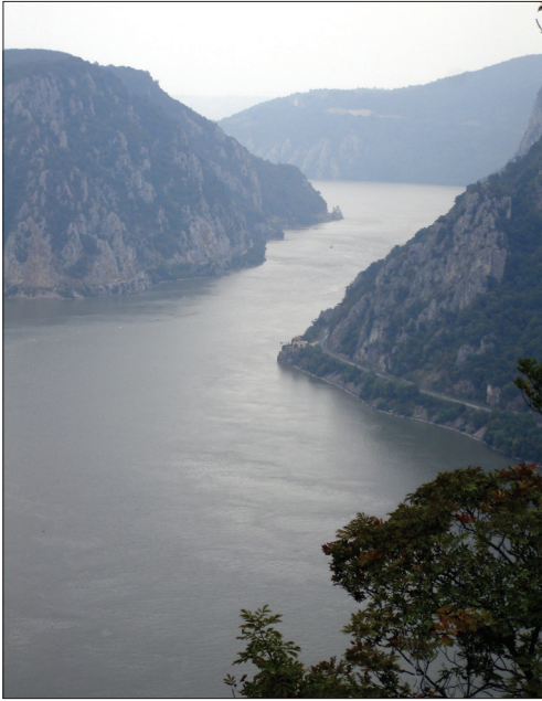
Iron Gate Reservoir