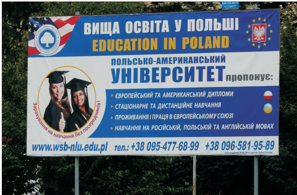
Photo 2. Advertisement of a Polish university in Uzhhorod, the seat of Transcarpathia.

tures have evolved, for instance the increase of permanent residence permit holders in Czechia might suggest the growing intention among Ukrainian migrants to settle for a longer period in the country (DRBOHLAV, D. and SEIDLOVÁ, M. 2016). Relevant to present article is the appearance of the so called “Polish route”: it refers to a recently reported phenomenon when Ukrainian citizens – to avoid the expensive and far more difficult Czech visa procedure – apply for Polish visa to enter Czechia, their original destination (DRBOHLAV, D. and SEIDLOVÁ, M. 2016, 122).