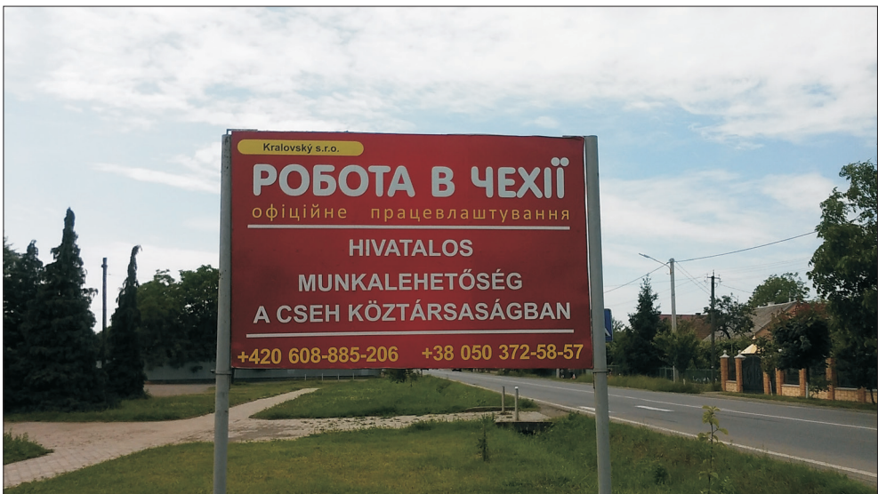
Photo 3. Bilingual (Ukrainian and Hungarian) billboard in the outskirts of Uzhhorod offering legal job opportunities in Czechia.

Following 2014, the Hungarian government has elaborated several economic