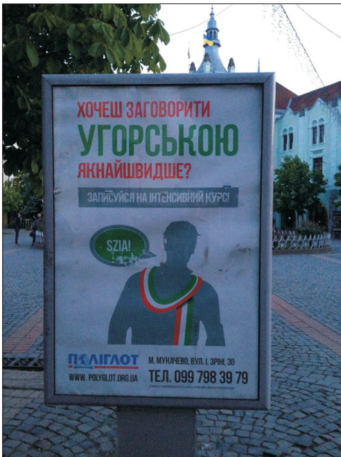
Photo 1. Poster advertising Hungarian language course in Mukacheve (May 2016).

This policy resonates to the features of trans-sovereign nationalism described by CSERGŐ, Z. and GOLDGEIER, J. (2004). According to their description, kin-states apply tools and rhetoric of trans-sovereign nationalism to project a certain identity and political influence externally into neighbour-