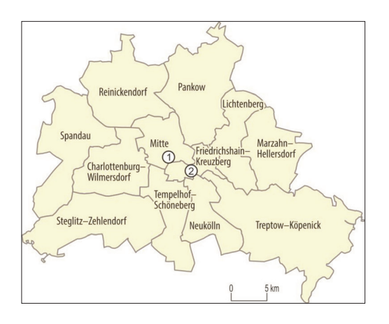
Fig. 2. Survey venues in Berlin. 1 = Brandenburg Gate (Borough "Mitte" – DGB); 2 = Kottbus Gate (Borough "Friedrichshain-Kreuzberg" – MyFest).

The protest traditionally organised by the confederation of German trade unions, the DGB ( Deutscher Gewerkschaftsbund ) has never been attended by huge masses, except during the heydays of protest in the early 1950s and the 1960s. A considerable peak in participation is observable in the early 1990s due to a general mobilisation after the fall of the Iron Curtain. The numbers of demonstrators has declined every year since and stagnated at an average of 10,000 during the 1990s (RUCHT, D. 2001). In the 2000s the number declined significantly. Labour union protests in Berlin