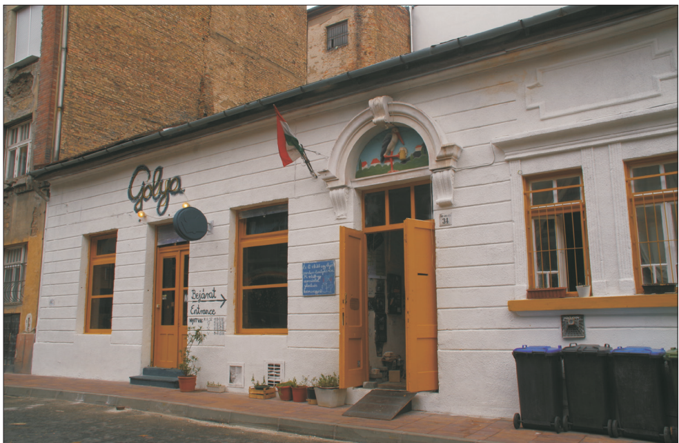
Photo 5. Gólya (it means stork in Hungarian) is the first “Communal House and Co-operative Presso” in Józsefváros organising concerts, literary nights, theatre workshops for young people