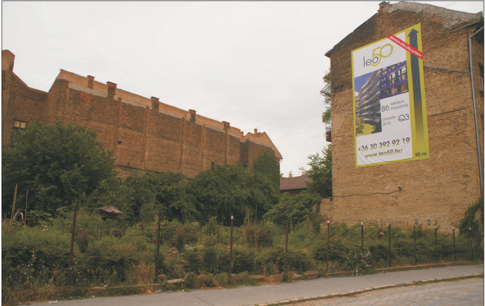
Photo 4. Leonardo community garden in the run-down neighbourhood provides an important meeting place for people with various background