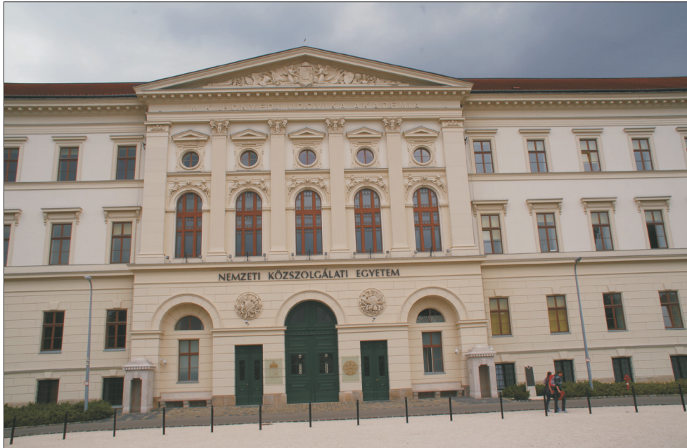
Photo 3. The new campus of the National University of Public Service accommodated in the 19 th century classicist building of a former military school

were undertaken within DIVERCITIES, a 7 th Framework Programme research project financed by the European Commission (full title: Governing Urban Diversity: Creating Social Cohesion, Social Mobility and Economic Performance in Today's Hyper-diversified Cities), between October 2013 and January 2016. Although DIVERCITIES was not specifically about studentification, yet, questions on the neighbourhood, the respondents' perceptions about the local society, their social ties and the role of local policies provided ample information on the topic.