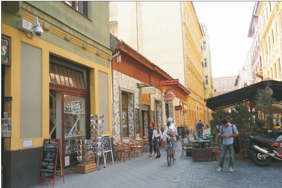
Photo 6. Typical consumption spaces of students and young intellectuals in the inner-part of Józsefváros

According to our findings, the consumption practices and patterns of students and long-term residents are quite different – which is a significant element of the parallel lives of various age/social groups ( Photo 6 ).