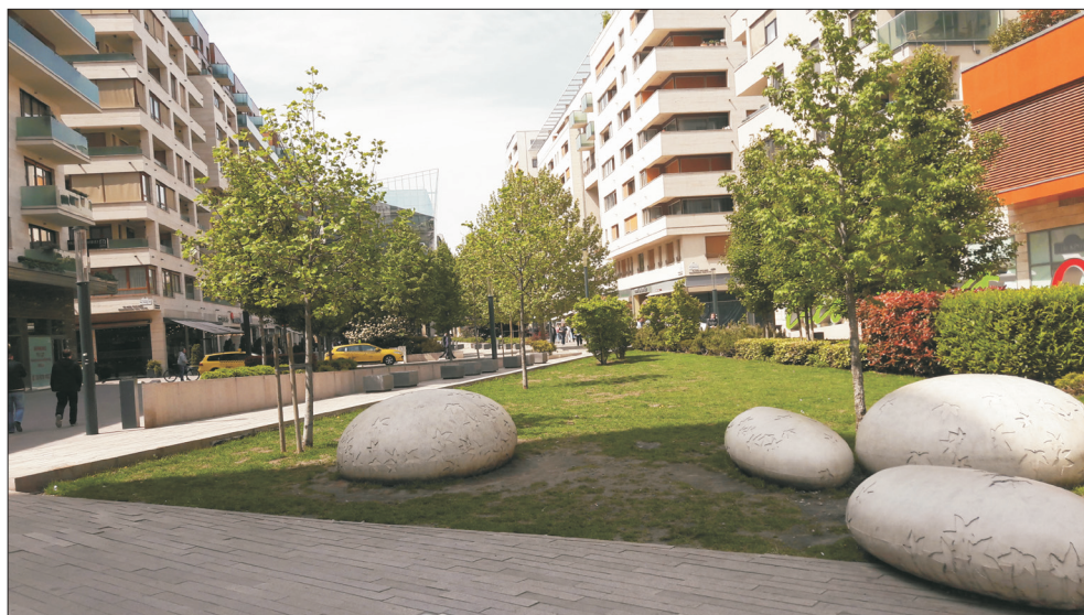
Photo 2. Corvin Promenade the epicentre of new-build gentrification in Józsefváros with upmarket dwellings and a new shopping mall

This paper is based on a series of in-depth interviews conducted with national- and city-level policy makers, as well as residents and entrepreneurs of Józsefváros. The interviews