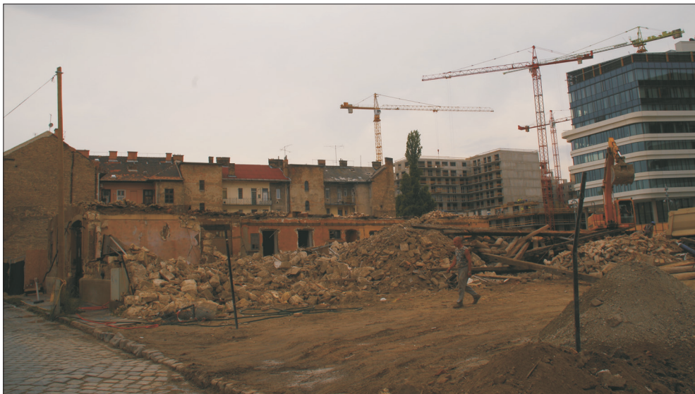
Photo 1. Large-scale, local government initiated regeneration activities in the centre of Józsefváros

Newcomers who moved to Józsefváros after the turn of the millennium have clearly contributed to growing social and cultural diversity. Furthermore, due to immigration, the social status of the area has been slowly growing but this is spatially an uneven process; in some parts of the district it is more pronounced and more visible than in others. The most intense changes took place in the neighbourhoods that were transformed by local government led urban regenerations (e.g. Corvin Quarter near the Grand Boulevard) where the old housing