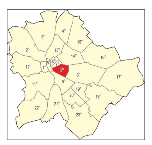
Fig. 1. Location of the case study area within Budapest.

Despite its relatively small territory (6.85 km²), the district is socially and culturally one of the most diverse areas of the city. The population of Józsefváros is 76,250 (2011) among them the proportion of non-Hungarian ethnic groups is 11.9 per cent – which is rela-