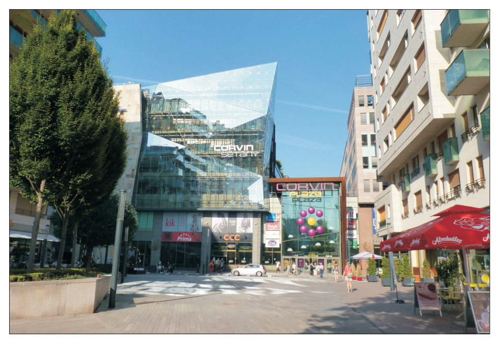
Photo 5. The Corvin Plaza, one of the largest shopping malls in Józsefváros

"The most common problem is the lack of clean places and green areas. (...) There are not enough playgrounds: in Palota Quarter there is only one, in Gutenberg Square"