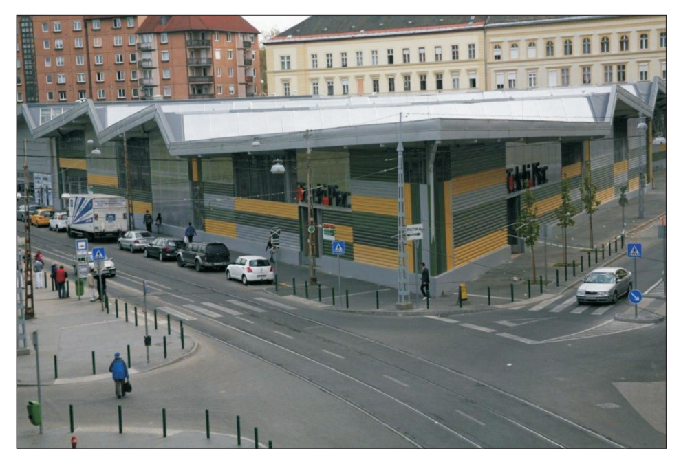
{\it Photo}~2. The renewed market at Teleki Square