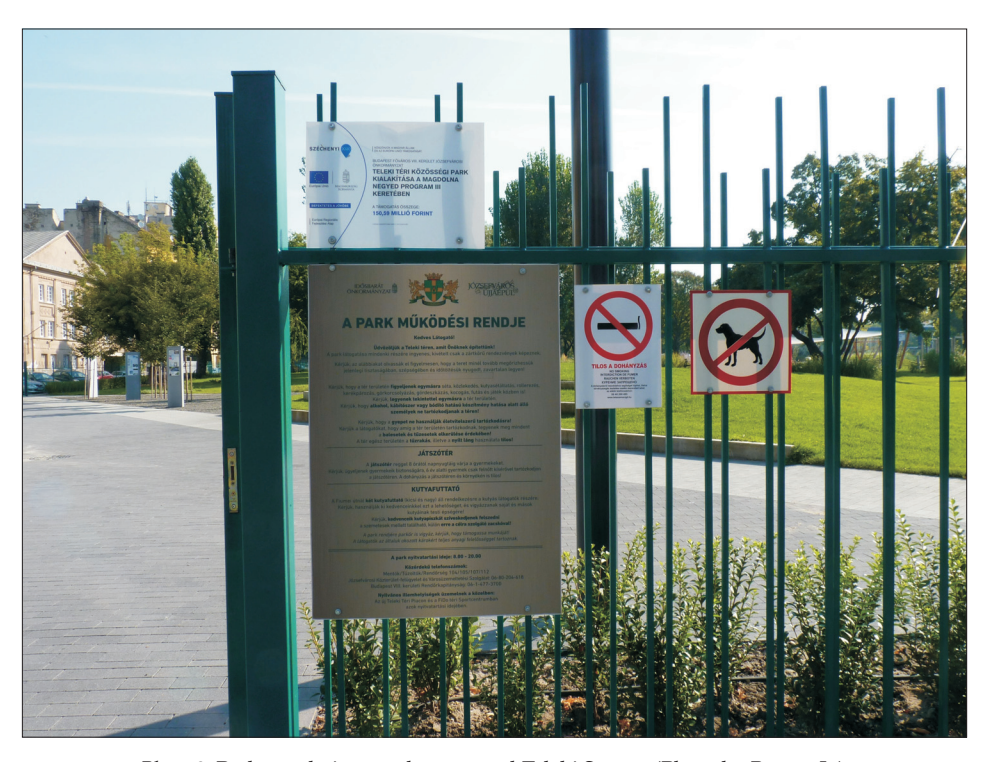
Photo 3. Park regulations at the renewed Teleki Square

On the district level, new rules were also introduced to protect the renovated playgrounds and parks; these defined the time periods of use as well as the appropriate behaviour (e.g. no eating in playgrounds, no sleeping or alcohol consumption in parks etc.) in these places ( Photo 3 ). The renewed parks and playgrounds are often fenced to keep away the unwanted users. In some cases, security guards were also hired to enforce the regulations. The local government of Józsefváros also banned eating the food waste from the trash cans in 2010 because 'it is unhealthy and dangerous' [9]. The local government also initiated a referendum in 2011 on begging and homelessness, trying to enforce the previously accepted anti-poor regulations. However, the referendum became unsuccessful, since the voter turnout did not reach the necessary threshold.