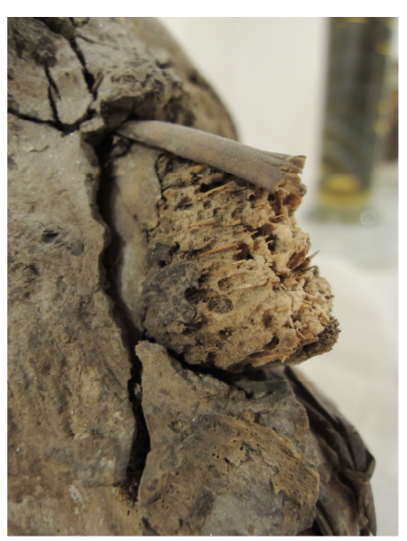
fig. 2. nose prothesis from right side