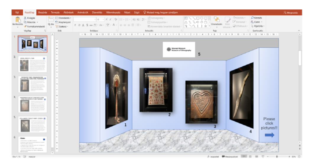
Figure 2. Group A's virtual museum

The major steps of the procedure introduced earlier – (1) pre-teaching; (2) students' own research; (3) students preparing a digital product; (4) students presenting their product; (5) assessment of the products – were followed again. At the end of the preceding class, students agreed to visit and explore the museum in the next class, and were presented the online guide to the temporary exhibitions of the Museum of Ethnography as well as the one to the permanent exhibition ZOOM A Change in Perspectives (Museum of Ethnography, n.d.). Then a video tutorial on how to create a virtual museum using PowerPoint slides (seamgreenNDM, 2014) was shown. Students then could try starting to create the background panels for the virtual museum. As a second step, the students – escorted by the teacher – visited the permanent exhibition of the museum taking photos of the exhibits of their choice (discovered while focusing on Hungarian cultural values) to be attached to their virtual museum created as group projects. The third step took place in the next session, when the groups of students worked on editing and finalising their virtual museum adding the photos, textual information, links, citation and animations. Presenting the virtual museums and assessment took place in the following class. As an example, Group A's virtual museum could be seen (Figure 2).