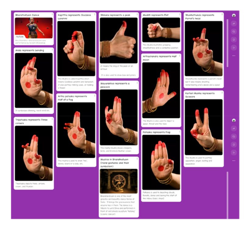
Figure 3. Student B's Padlet explaining the symbolism of Bharatnatyam Dance hand gestures Note : Adapted from the YouTube video on single hand gestures (Lakshmi Karthik - Sri Nrithya Lakshana, 2018) with written explanations added by student.

From at least the second step on, no one-way – teacher to student – knowledge transfer could be seen, and by the end of the process, the roles were reversed. By seeing each other's digital bulletin-board-supported presentations, which promoted a deeper understanding of certain aspects of each other's dance culture and the recognition of possible common features, they came closer to realising transcultural communication across cultural boundaries, acknowledging the universal presence of distinctive traits and symbols.