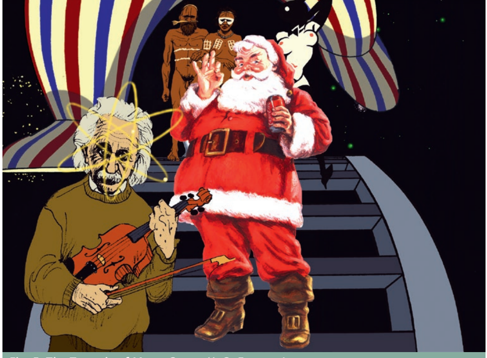
Fig. 5. The Tragedy of Man – Scene 11: O, Fortuna!

Saint László and the Cuman warrior is a parable of Hungarian history, for which there is even an astrological explanation; still, most importantly, it is also an inner spiritual struggle. It is the uniquely resonant clash of the Christian and pagan world in the soul of Mankind. Yet, Marcell Jankovics is a pessimist. For him, the legend does not end with Saint László's victory, but with a surrender of identity: 'That was the fate of the legend-frescoes. They got plastered over; or, in the course of renovations, they vanished for centuries before the believers' eyes' (Jankovics 1987, 91). What was perhaps important to Marcell Jankovics, in terms of his faith and its relation to his art, was that the religious – be they Christian or Chinese Taoist – should declare the same ethical foundation: 'Technological development separates Mankind from the humility needed to behave and act properly in the world. [...] Hence, the greatest sin that people can commit against themselves and the world is not to accept the world's obvious, inevitable order and to try forcing their own will upon the world. That is like Mankind wishing to