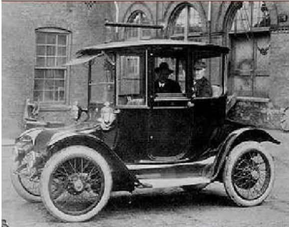
Picture 1 - Thomas Davenport's electric car

Edison developed nickel-iron batteries for his self-designed electric cars, but these eventually did not make series production. [1] [2]