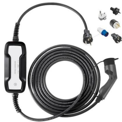
Picture 4 - Charging cable for Mode 2