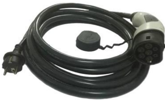
Picture 3 - Charging cable for Mode 1

When all conditions are met, the controller only in this case applies voltage to the vehicle charger. The maximum allowable current is 32 A, the voltage is maximum 250 V for 1 phase, while 480 V for 3 phases [3] [4].